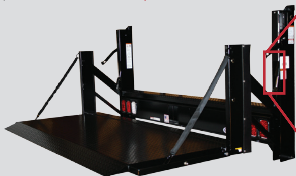
* Shown with optional light kit.

To see more of our All-New G 2 , please visit www.TommyGate.com